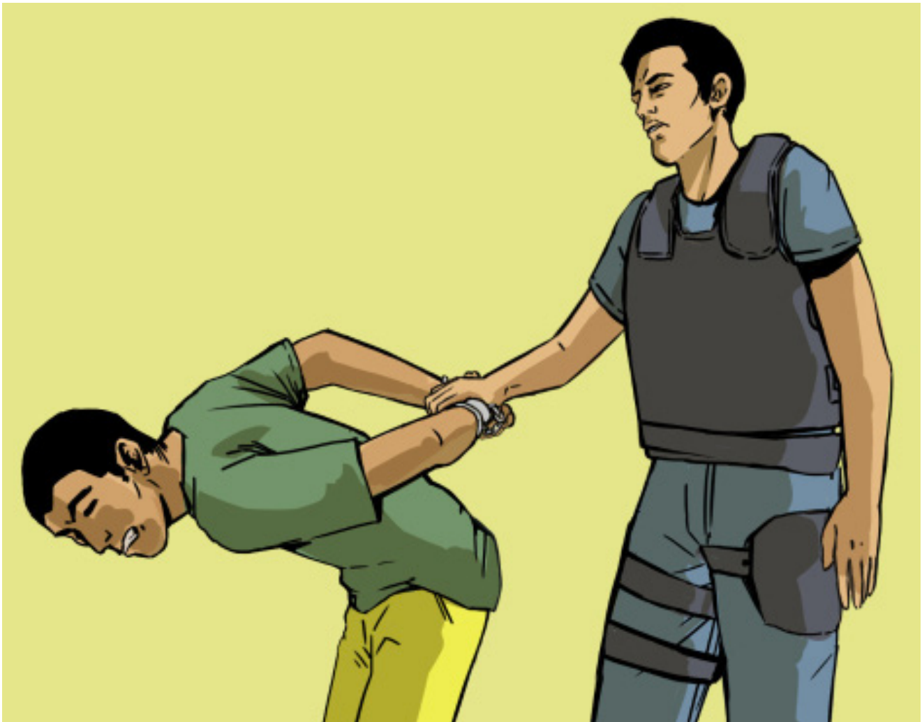
Lever method adopted for guiding a restrained person by means of application of handcuffs behind the back - Causes intense discomfort, pain and high risk of resulting in physical injuries.

Furthermore, metal leg restraints risk causing deep vein thrombosis and necrosis when used for prolonged periods. Their use involves the same risks regarding lacerations and other harms posed by the prolonged use of metal instruments of restraint in general. As a rule, metal leg restraints should not be used in judicial hearings and, if they are used, this should never be for more than the minimum time necessary.